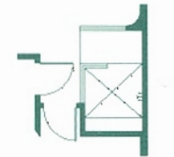
OPT. SNAIL SHOWER